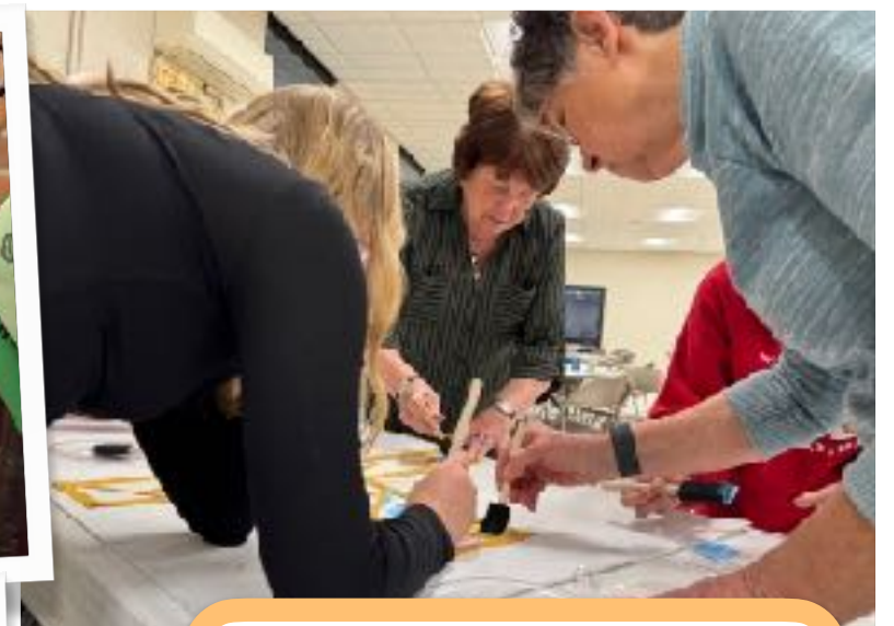
Mid-Lenten Potluck — March 11