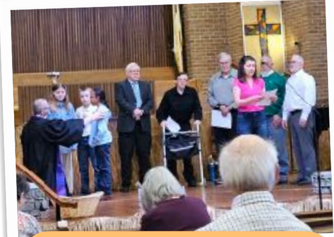
Dramatic Lenten Readings