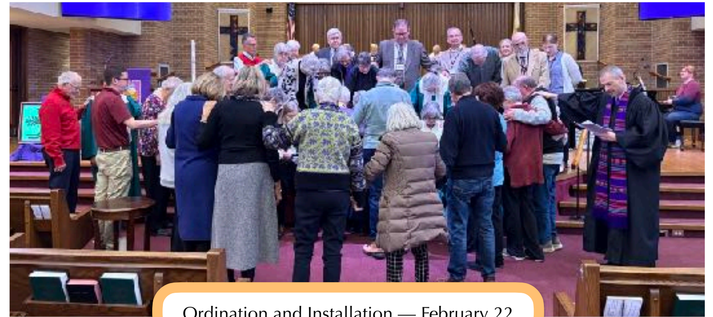
Ordination and Installation — February 22