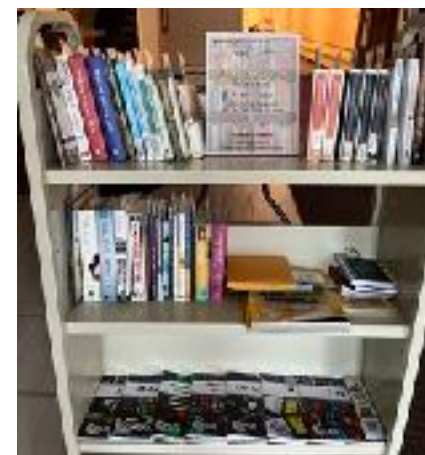
The Little Free Library will help the pantry feed guests' spirits as well as their bodies.

books. If you have books to contribute, please leave them on the cart outside the pantry. These books will feed the spirit, just like food feeds the body!