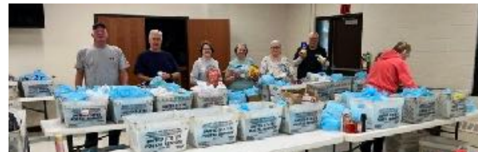
Volunteers sort through the bins and bins of food donated through the Post Office's Letter Carrier's Stamp Out Hunger Food Drive.

Pantry "Free Little Library:" As we feed the body, we want to feed the soul, so we have also started a Free Little Library. We purchased a book cart, Bill make bookmarks, and we are up and running! We have inspirational reads, devotionals, cookbooks and children's