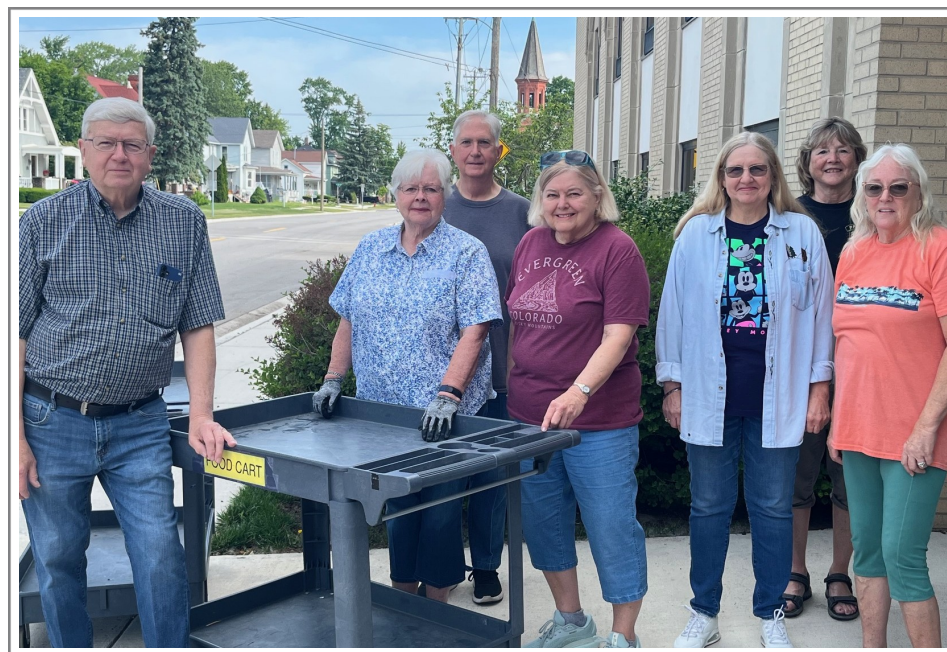
Pantry volunteers waiting for a large delivery of food from the Food Bank of Eastern Michigan.

None of this would have been possible without the help of the congregation. From opening the pantry with food from our Lenten food drive, to your contributions for "Items of the Month" and more, to monetary donations which allow us to shop from the Food Bank of Eastern Michigan (FBEM) at greatly reduced prices, your support has been most appreciated. The community has chipped in with grants, food drives, and other gifts. We have been blessed beyond measure to be able to feed our hungry neighbors.