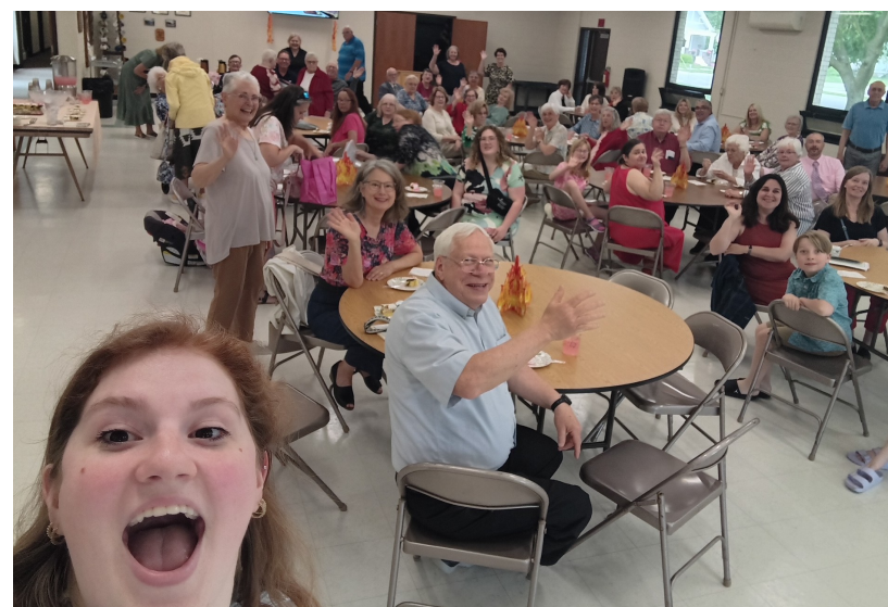
Church members celebrate the pantry's first birthday.

We are grateful to the people who coordinate the Westminster Community Pantry and all who volunteer their time. We give thanks to all the people who donate to keep it going. We thank God for giving us the ability to open our doors to those in need. What an awesome way to share God's love and abundance with our community! Happy Birthday, Westminster Community Pantry!