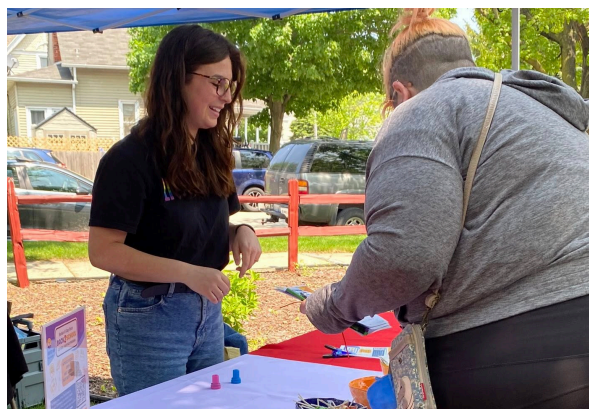
On Sunday, June 1, Westminster hosted its annual End-of-School Block Party and invited everyone for fun, games, crafts and tasty snacks! About 300 people attended and enjoyed the day.