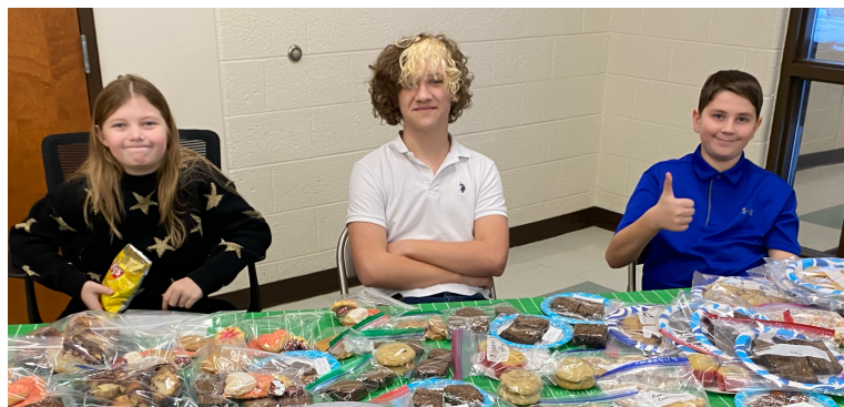
Thank you to everyone you donated baked goods for the Youth Bake Sale. We raised more than $400 which will be used for future youth events!