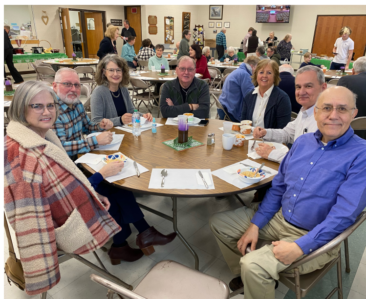
February 2nd was a busy day for members of Westminster. First came the annual meeting during the morning worship service, then the Souper Bowl of Caring and bake sale, and wrapped up in the evening with a group attending the Saginaw Spirit's Faith Night.